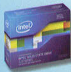
Solid State Drives (SSD) Intel